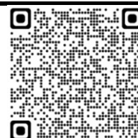
View all Active Notice to Mariners using the above QR Code

Telephone calls, VHF radio traffic, CCTV and radar traffic images may be recorded in the VTS Centres at Gravesend and Woolwich